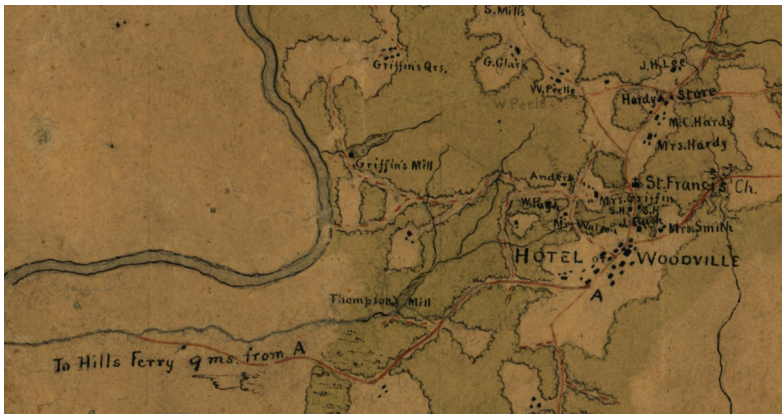
1863 Civil War era maps

There has to be a rational, reasonable and at best, a provable place to put a Patent on a map. What I look for initially, is what I call an "Anchor Point". That is a place that cannot be doubted... it can be used with confidence to base other patents around it. Each patent in a grouping supports the other patents in the group. The idea is to eventually create an accurate map of the past.